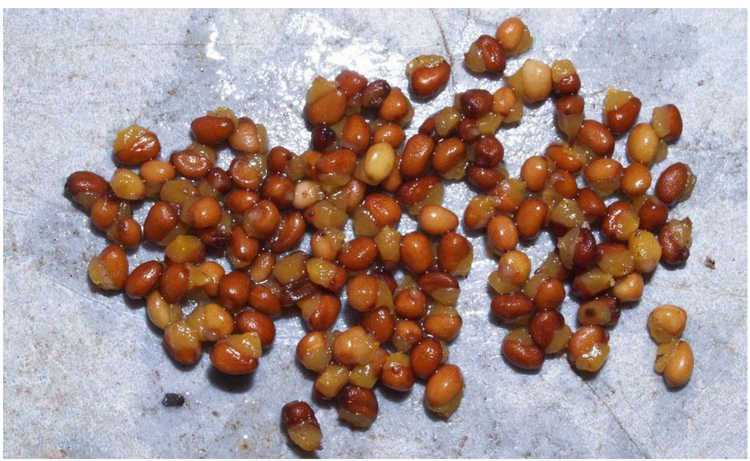
Trillium ovatum seed after soaking

Here for direct comparison are the Trillium ovatum seeds before and after soaking to show the effect of rehydration.