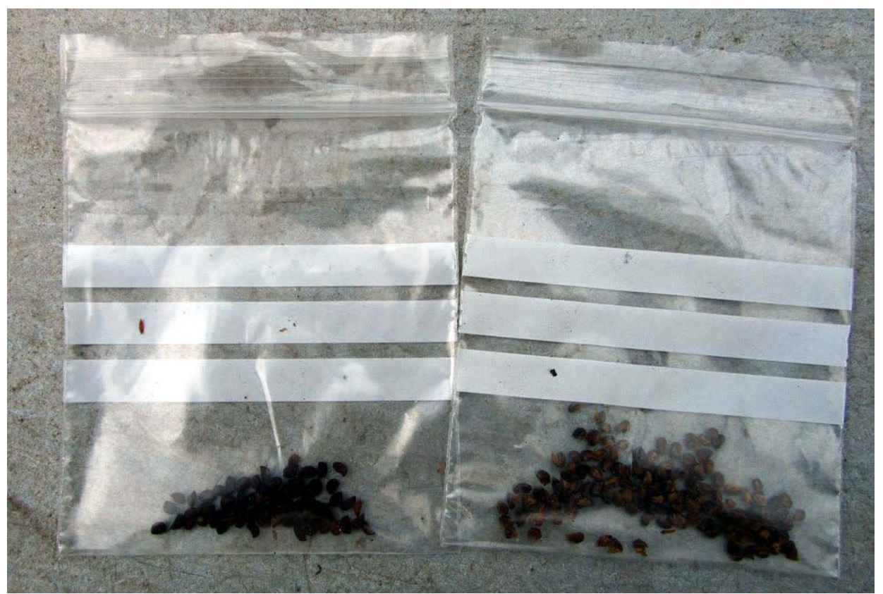
Erythronium and Trillium seeds

I also got a few Trillium ovatum seeds from the same source and when they arrived they were in paper packets which allow the moisture to escape and thus minimise the risk of the seeds rotting. As soon as I received them I transferred the seeds into plastic packets – I could have used any small container but these are the most convenient - adding a little water and the tiniest smear of soap – just enough to break the surface tension and allow the seeds to absorb the water.