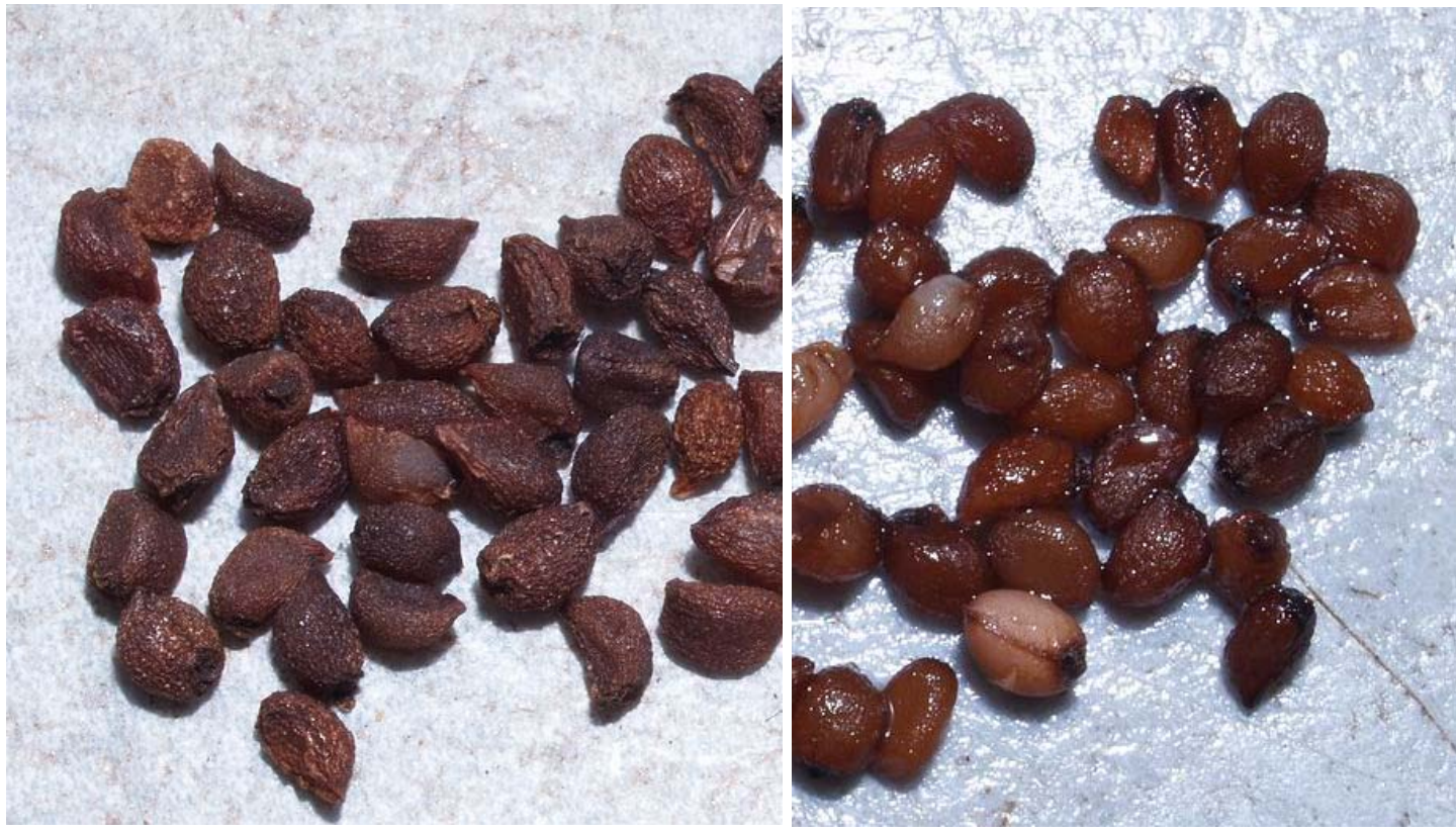
Erythronium seeds before and after soaking Here is a quick comparison of the dry and soaked Erythronium seeds.