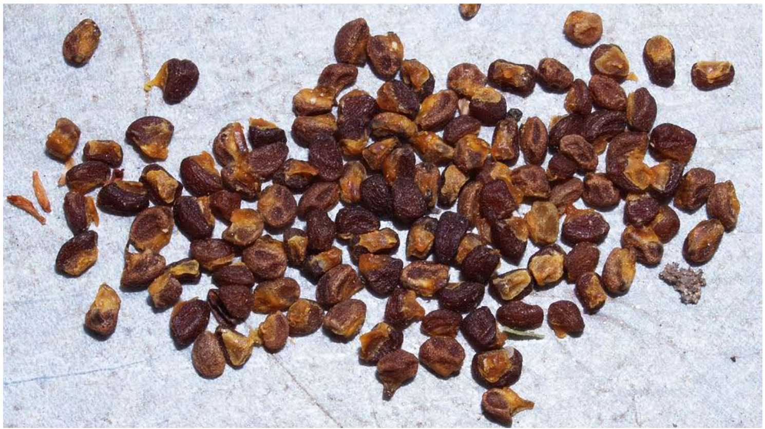
Trillium ovatum seed before

Here for direct comparison are the Trillium ovatum seeds before and after soaking to show the effect of rehydration.