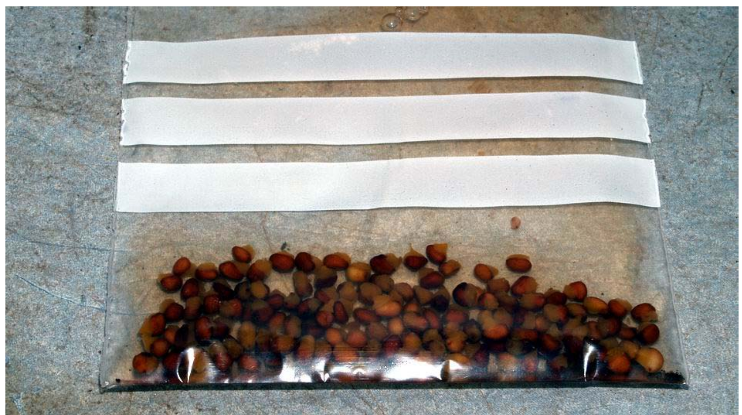
Trillium ovatum seeds soaked

I also got a few Trillium ovatum seeds from the same source and when they arrived they were in paper packets which allow the moisture to escape and thus minimise the risk of the seeds rotting. As soon as I received them I transferred the seeds into plastic packets – I could have used any small container but these are the most convenient - adding a little water and the tiniest smear of soap – just enough to break the surface tension and allow the seeds to absorb the water.