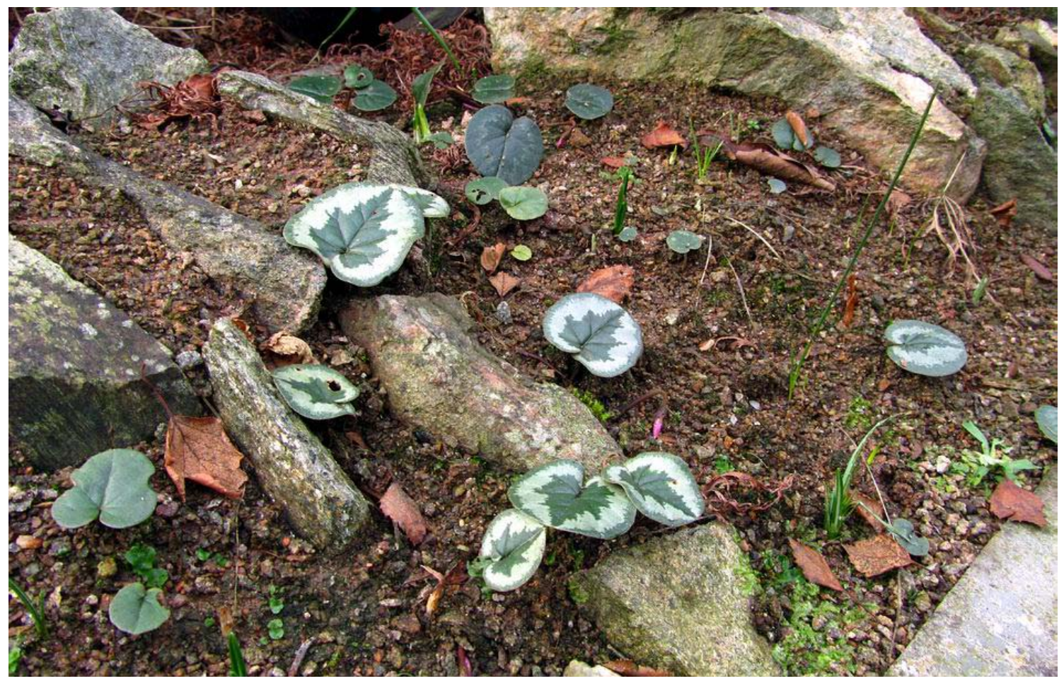
Cyclamen coum seedlings

I always state that nature is the best teacher if only we can interpret the lessons correctly. I sowed these Cyclamen coum seeds around 2cms deep, directly into the sand plunge bed as soon as they ripened and, two years on, the first of them are flowering. As this is quicker than I can flower them when I grow them in seed pots I have to conclude that their growth must get checked by the more extreme swings of moisture levels and or temperatures in the pots.