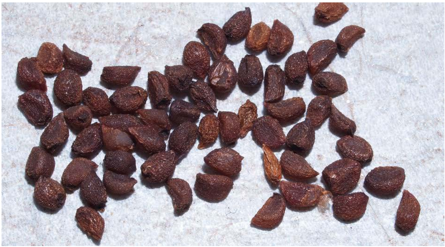
Erythronium oregonum seeds B – bounced flash

However you can very simply greatly improve the result by using a reflector to bounce the flash light around. Here I have used a rectangle of polystyrene, (part of an old fish box lid) as a white reflector. Angling it slightly and holding the flash against it in effect greatly increases the size of the light source and so reduces the amount of shadow. I can further improve the effect by having another reflector at the bottom of the camera to bounce the light back into the other side of the subject.