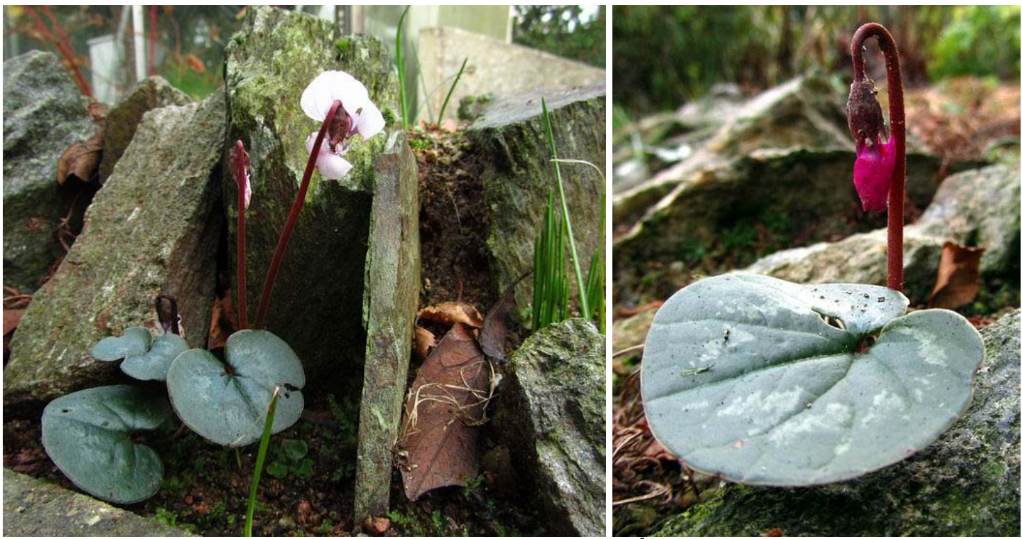
Cyclamen coum - first flowers on 2<sup>nd</sup> year seedlings

I always state that nature is the best teacher if only we can interpret the lessons correctly. I sowed these Cyclamen coum seeds around 2cms deep, directly into the sand plunge bed as soon as they ripened and, two years on, the first of them are flowering. As this is quicker than I can flower them when I grow them in seed pots I have to conclude that their growth must get checked by the more extreme swings of moisture levels and or temperatures in the pots.